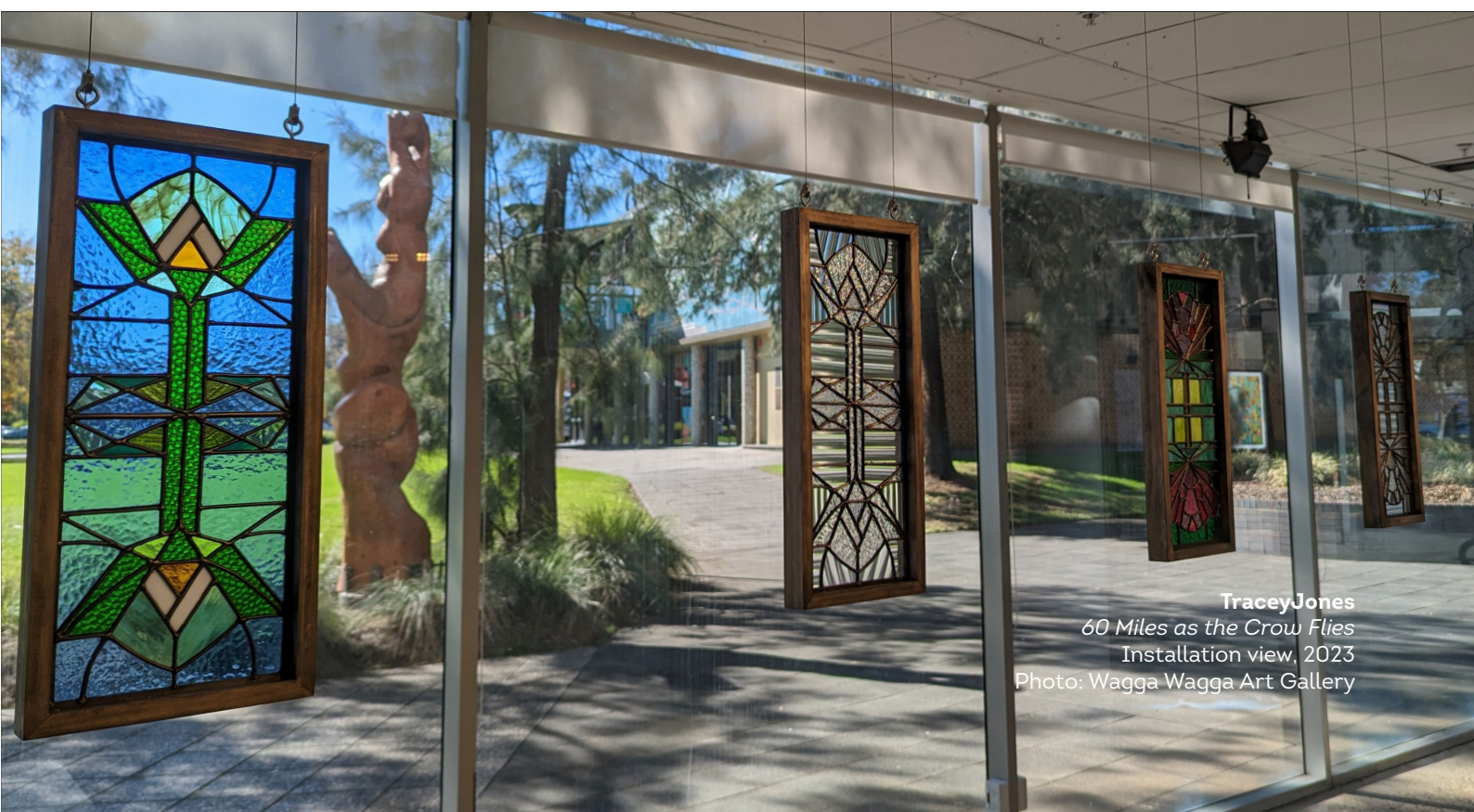
Tracey Jones 60 Miles as the Crow Flies Installation view, 2023

Wagga Wagga Art Gallery reserves the right to take images and video during the exhibition for the purposes of promotion and/or documentation. Such material may appear in Council promotions and publications. Where used in this way the artist and artworks will be attributed.