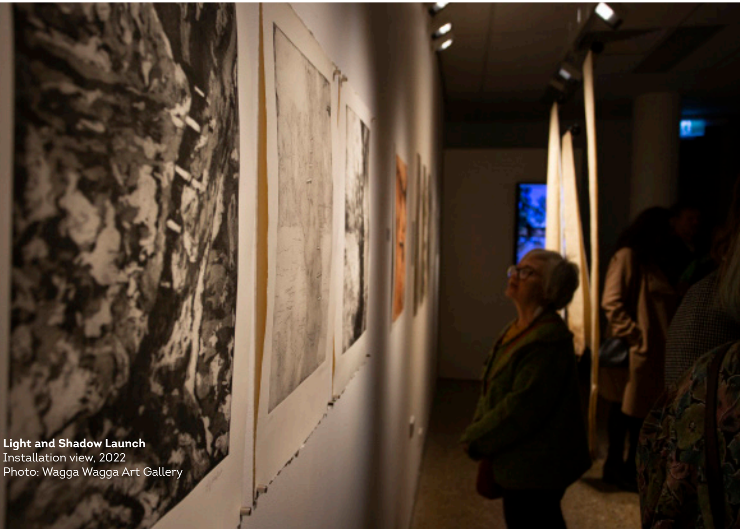
Light and Shadow Launch Installation view, 2022

Email: egan.mary@wagga.nsw.gov.au Phone: (02) 6926 9660