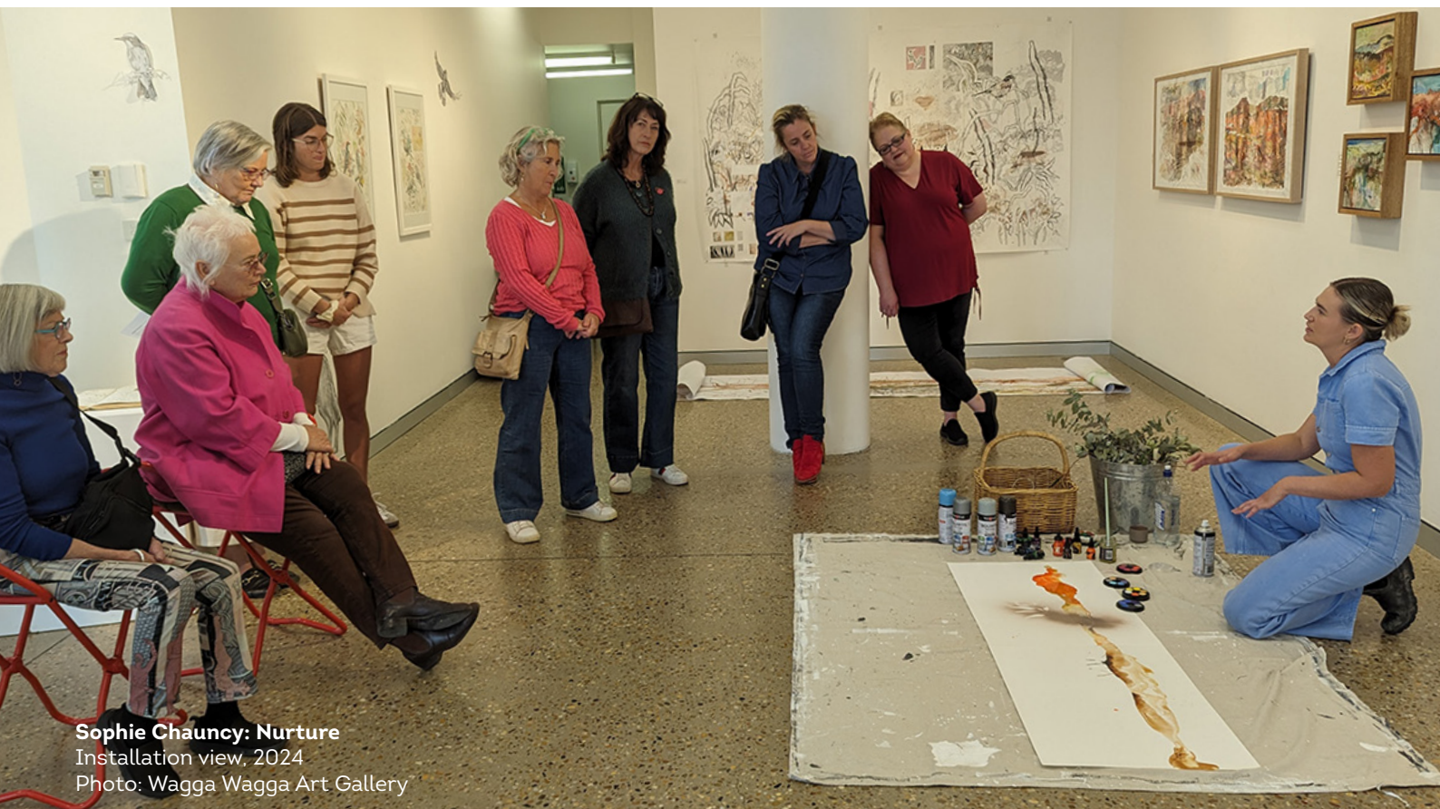
Sophie Chauncy: Nurture Installation view, 2024

Email: egan.mary@wagga.nsw.gov.au Phone: (02) 6926 9660