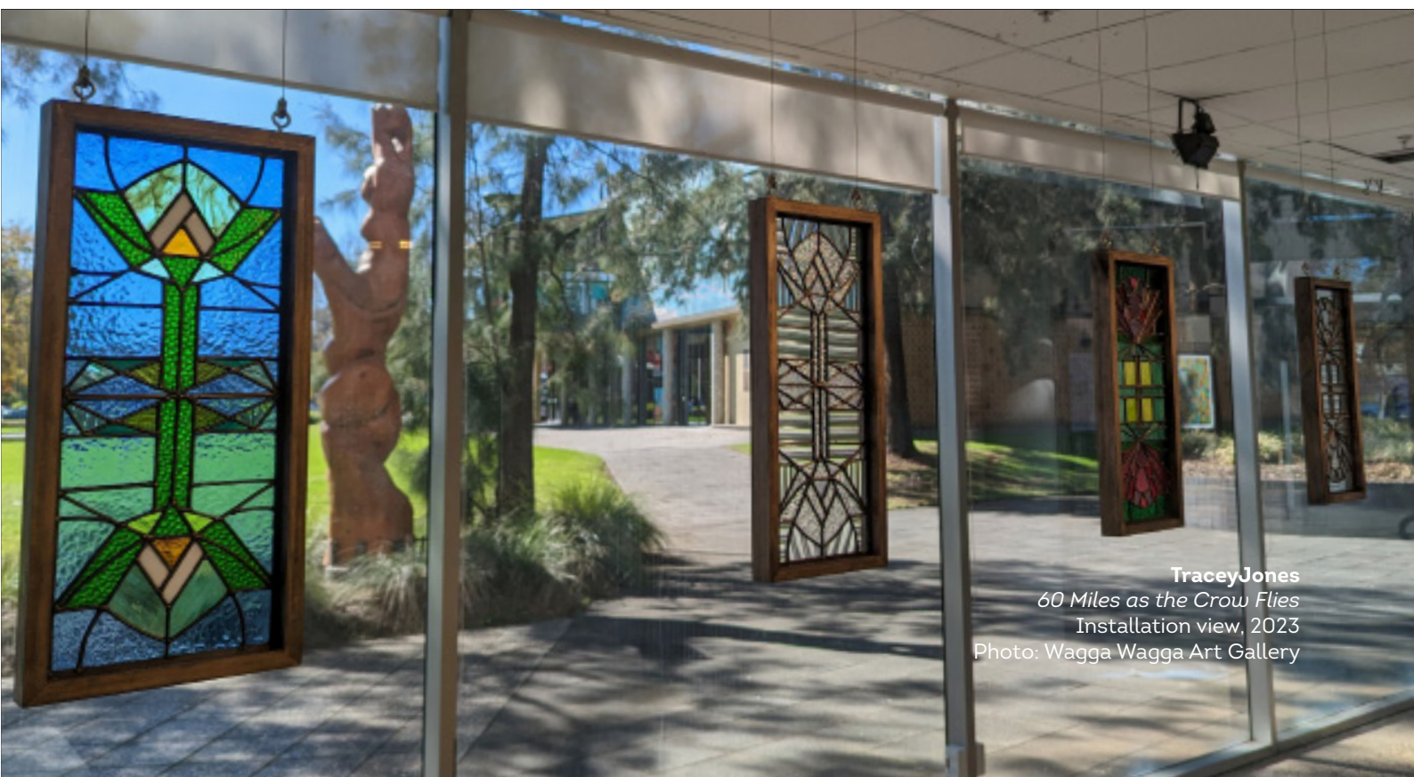
Tracey Jones 60 Miles as the Crow Flies Installation view, 2023

Wagga Wagga Art Gallery reserves the right to take images and video during the exhibition for the purposes of promotion and/or documentation. Such material may appear in Council promotions and publications. Where used in this way the artist and artworks will be attributed.