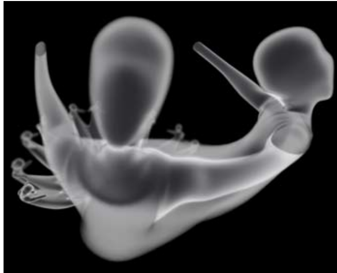
The Transmute Collective Shared Body Group

This shared experience allows participants to communicate with each other using multiple senses, despite the fact that they are separated and cannot see or hear each other.